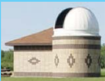
The Blue Moon Observer

The business of the DPAS is largely conducted at the Board meetings to leave the general meetings open for programs. The Board meetings are held at the Astronomy Center at 7 PM on Monday, 8 days prior to the following general meeting. Members of DPAS are invited to attend Board meetings.