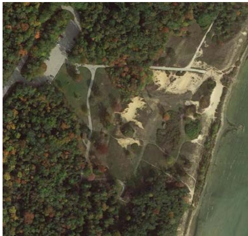
Parking lot 3 and picnic and sky-viewing areas at Newport State Park.

Big Thanks to naturalist Beth Bartoli and the staff at Newport State Park for all they do to accommodate dark-sky enthusiasts and astronomers.